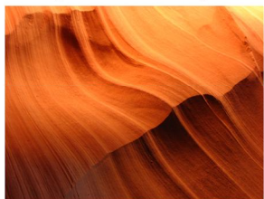
Beautiful Navajo Sandstone, great example of cross-bedding throughout the canyon

The mysterious and haunting beauty of Antelope Canyon (also known as "Corkscrew Canyon") awaits the adventurous traveler who seeks to discover one of the most spectacular, yet little known attractions of the Lake Powell area. A tour to this awe-inspiring sculpture set in stone is a must for amateur and professional photographers alike. Come see nature's surprising masterpiece of color.