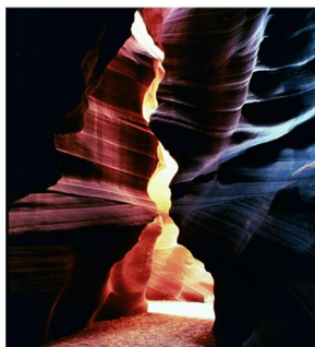
Colors vary from red, orange, purple, and blue