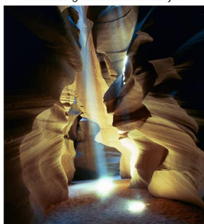
Light-shaft in second chamber