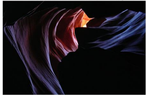
Purple and Blue colors