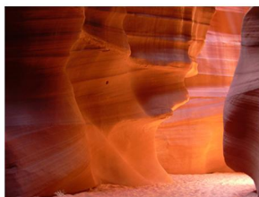
Reflective light producing orange glow inside the canyon's first room