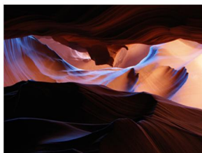
Beautiful glow inside the canyon