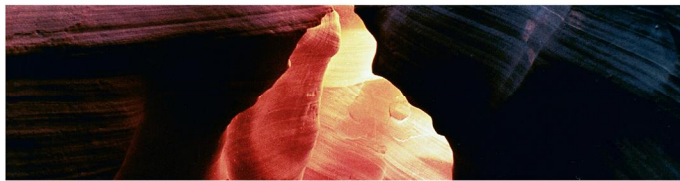
Light-shaft within the canyon